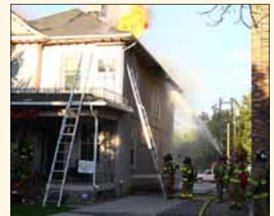
VOA's Transition Home burns.